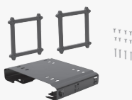
HP Desktop Mini v4+ VESA Sleeve

Wrap your HP Desktop Mini PC in the HP Desktop Mini v4+ VESA Sleeve to securely mount it—with or without an Expansion Module 1,2 —behind your display, position the solution on a wall, and lock it down with the integrated security bracket and optional HP Ultra-Slim Cable Lock.