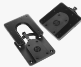
HP Quick Release Bracket 2

Use the HP Quick Release Bracket 2 to attach your HP Desktop Mini to an HP display 1 and a variety of stands, arms or wall mounts. 2 The failsafe "Sure-Lock" mechanism snaps the PC securely in place, and can be further secured with a theft-deterrent security screw.