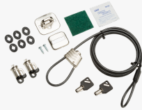
HP Business PC Security Lock v3 Kit

Help prevent chassis tampering and secure your PC and display in workspaces and public areas with the affordable HP Business PC Security Lock v3 Kit.